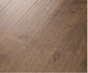
17051 Low Tide