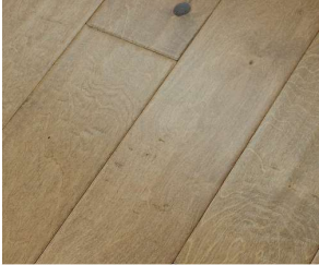
1023 Crescent Beach